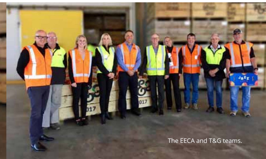
The EECA and T&G teams.