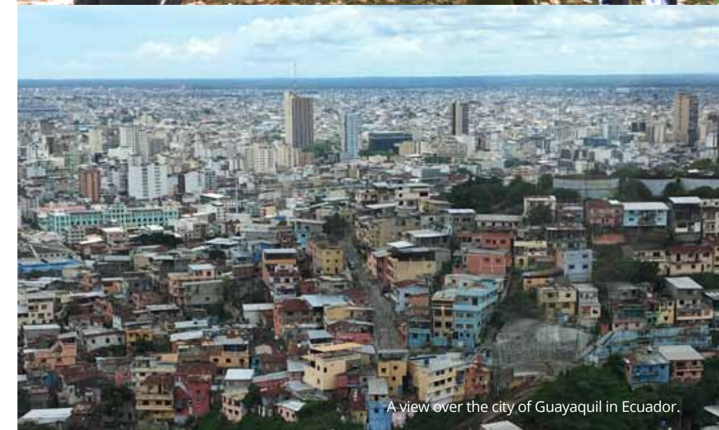
A view over the city of Guayaquil in Ecuador.