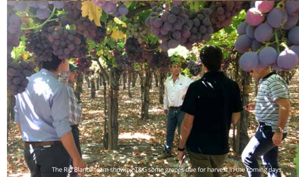
The Rio Blanco team showing T&G some grapes due for harvest in the coming days.