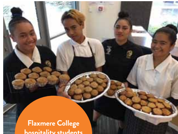
Flaxmere College hospitality students and T&G apple muffins.

The level two hospitality class students were given a guided tour of a T&G orchard before viewing a working packhouse and following the fruit journey through to dispatch. The 16 year old students were briefed on health and safety, marketing and the wide range of careers available to them in the horticulture industry during the tour. The students returned to their classrooms impressed by the scale of T&G's operation and armed with apples. Their level one hospitality colleagues made delicious muffins for a staff morning tea with the fruit taking the tour full-circle.