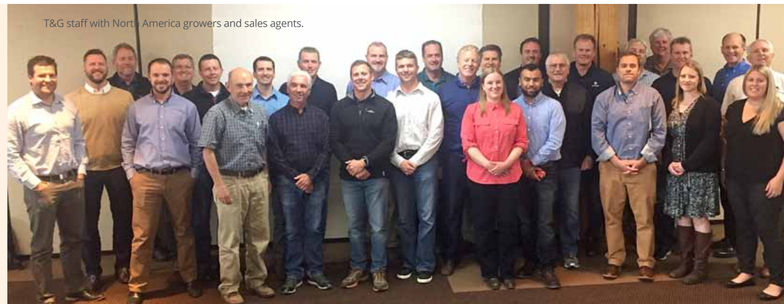
T&G staff with North America growers and sales agents.